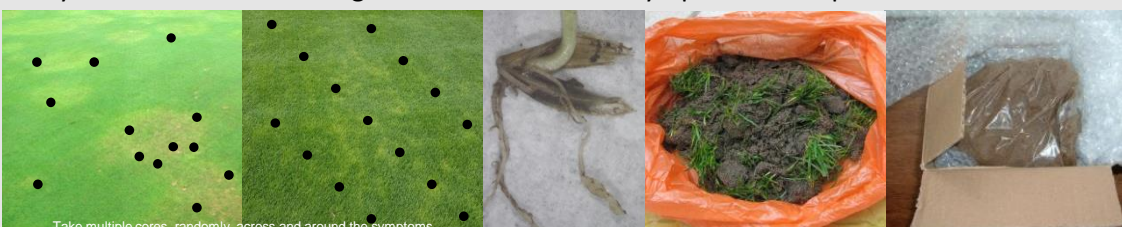
Take multiple cores, randomly, across and around the symptoms